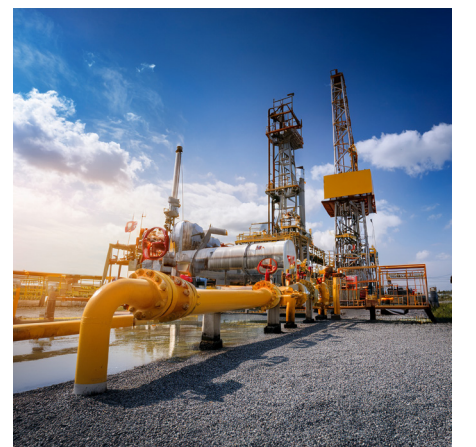
Oil and Gas Industry