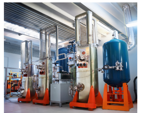
High-precision Industrial Operators